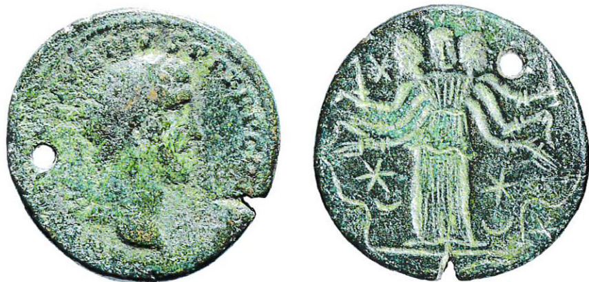
Figure 3.4 Dupondius of Antoninus Pius (AD 140–45) reworked on the reverse with the image of triple Hecate: two arms hold daggers, two whips and two torches; a snake below her; stars and crescents around. Actual coin size 2.84 cm Ø.