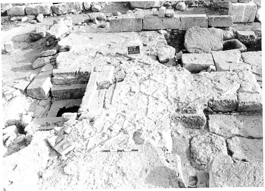
Figure 3.5 Tas-Silġ (Malta). General view of the baptistery area, seen from the north: on the left, the baptismal font.

the path followed by the catechumens, who entered the font by a series of steps placed inside of the short sides of the basin and exited it by stepping up and out, when the rite was ended. The number of steps may even have sometimes had symbolic implications, as explained by Isidore of Seville (Jensen 2011:229).