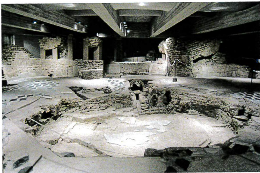
Figure 3.3 Font of the Baptistery of San Giovanni alle Fonti in Milan.

is somewhat less certain for the coins found in Piacenza and Trier. Almost 60 small bronze coins measuring about 8 mm were discovered in 1857 in the initial section of a channel in the baptistery of the first town, but the details about the discovery are not adequate to allow us to understand whether the channel was effectively connected to the leaden pipe inserted in the multi-lobed font. Also, the function of the channel is doubtful, because it is not clear if it was used for carrying water to the font or for removing the water. Moreover, the coins are now unavailable (Facchinetti 2008:45).